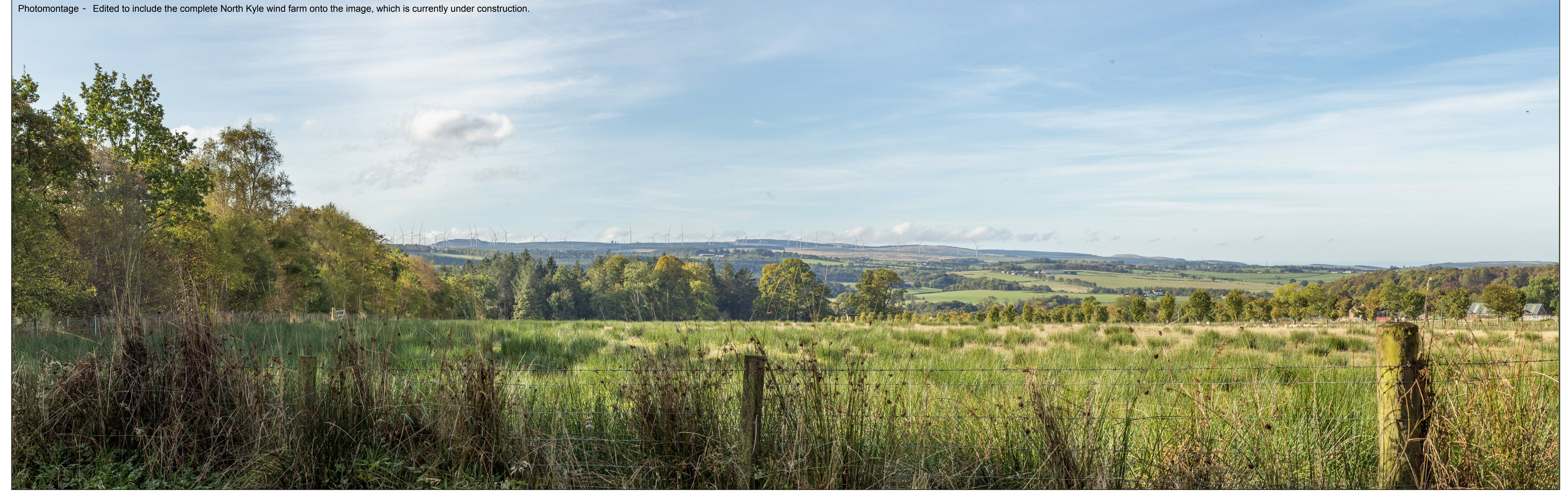
Viewpoint Information OS Reference: E254316 N621878 Distance to nearest turbine: 10,195m (T1) Angle of view: 53.5° (planar) Bearing to centre of photograph: 216.6° Principal distance: 812.5mm Paper size: 841 x 297 mm (half A1) Correct printed image size: 820 x 260mm

Camera: Nikon Z6ii Lens: 50mm Fixed Focal Lens Height: 1.5m Date & Time: 03/10/2024 10:15