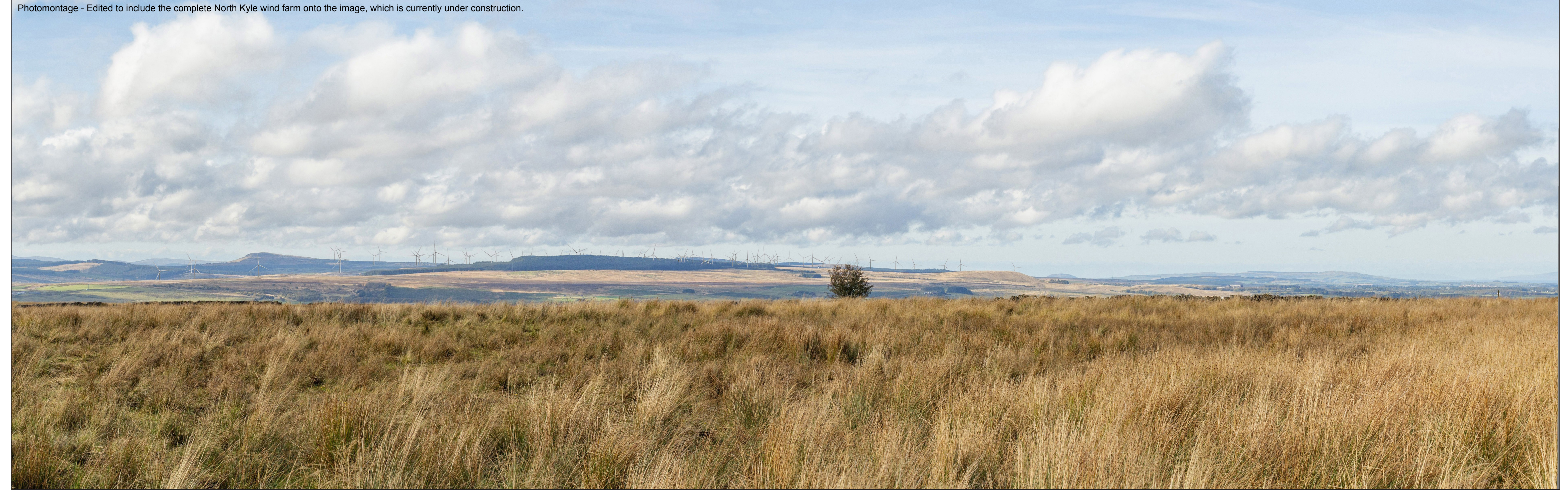
Viewpoint Information OS Reference: E260892 N618123 Distance to nearest turbine: 13,015m (T8) Angle of view: 53.5° (planar) Bearing to centre of photograph: 247.2° Principal distance: 812.5mm Paper size: 841 x 297 mm (half A1) Correct printed image size: 820 x 260mm