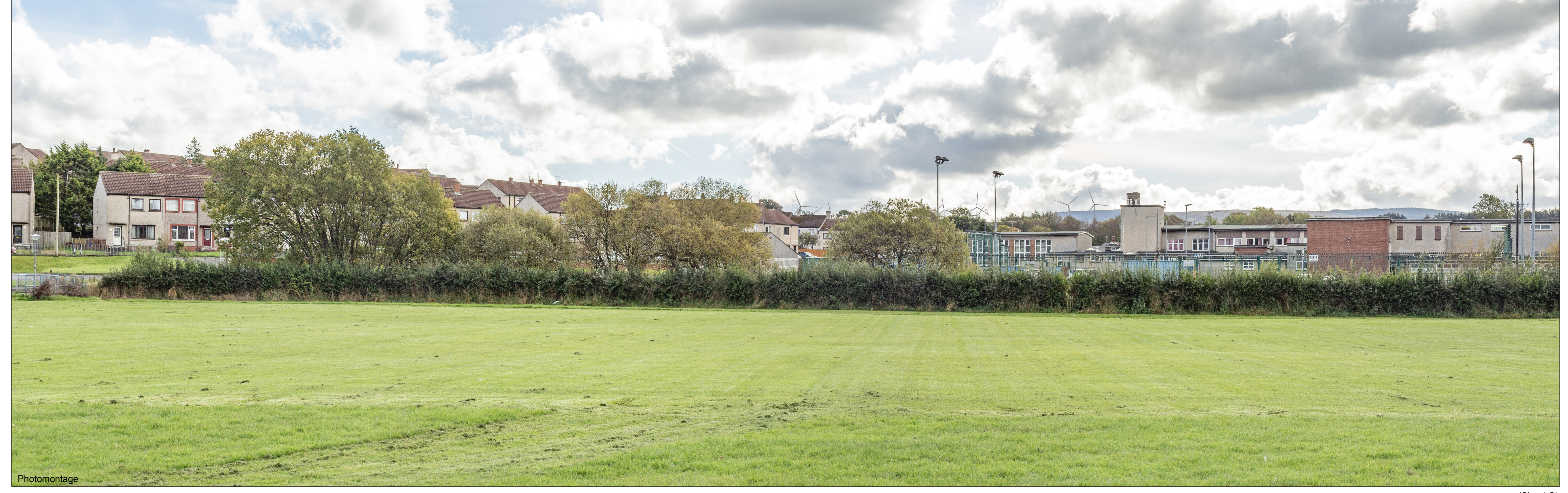
Viewpoint Information OS Reference: E244401 N618330 Distance to nearest turbine: 4,779m (T1) Angle of view: 53.5° (planar) Bearing to centre of photograph: 150.8° Principal distance: 812.5mm