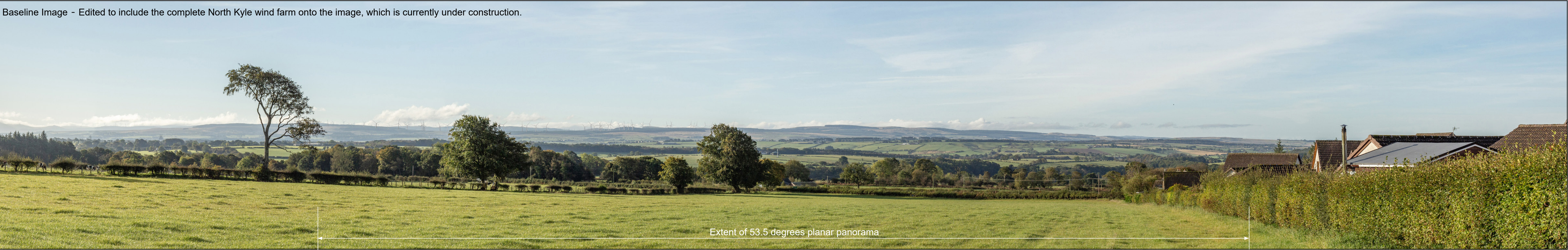
Baseline Image - Edited to include the complete North Kyle wind farm onto the image, which is currently under construction.